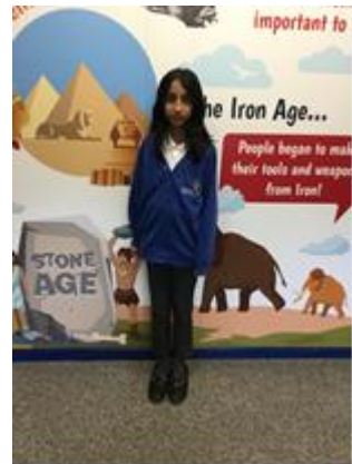
Maida Year 6