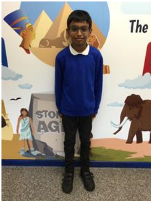
Sahir Year 5