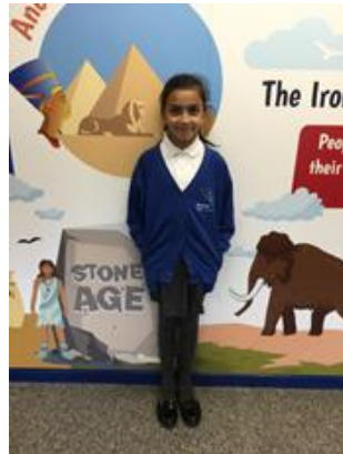
Safaa Year 5